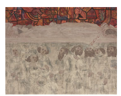
Miyakita Chiori: Whole Life of Empress (2015)