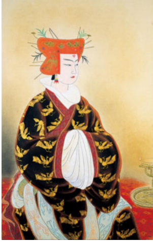
Yasuda Yukihiko: Wang Zhaojun (1947)