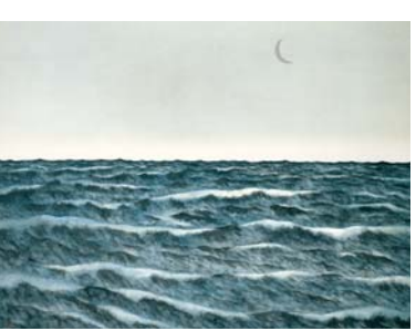
Yokoyama Taikan: Winter (from Twenty Scenes of Mt. Fuji and The Sea 1940)