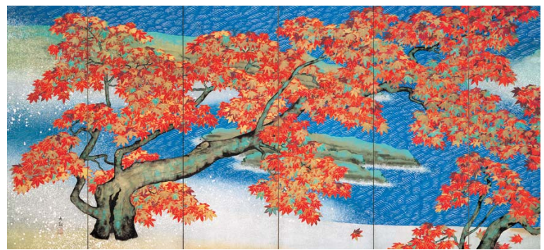
Yokoyama Taikan: Autumn Leaves (Left Screen 1931)