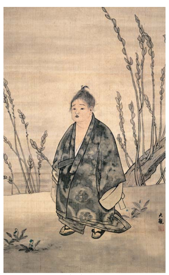
Yokoyama Taikan: Selflessness (1897)