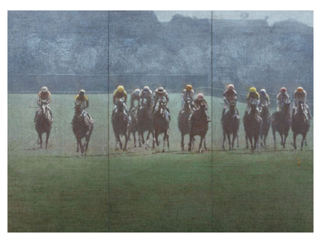
Miyasako Masaaki: Phase Space (2017)