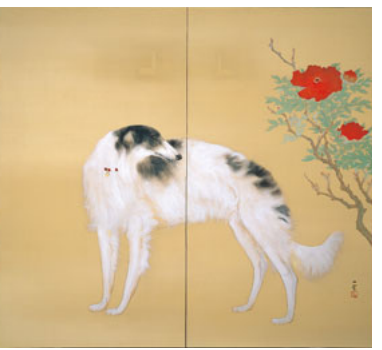
Hashimoto Kansetsu: Dogs from Europe (Right Screen 1941)